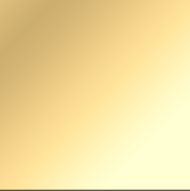
Satin Gold - SGD