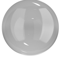
Smoke - SMK